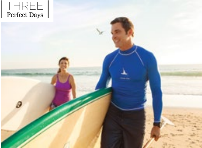
Take advantage of Monarch Beach Resort's ocean-side location with water sports.