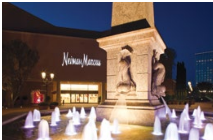
Shop at Fashion Island

You can also head to Newport Beach, where Fashion Island awaits. This outdoor mall has shops as varied as Alice + Olivia, Trina Turk and