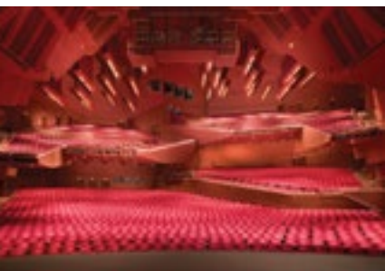
Segerstrom Center for the Arts