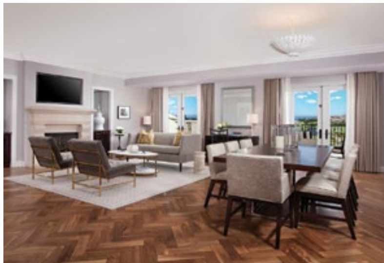
A suite at the resort

you can take around the Newport Bay. Operating a Duffy boat is easy and you can cruise wherever you and your significant other choose to go. You can also tie up in Newport Harbor and stop at one of several seaside dining options for lunch, such as Newport Landing Restaurant and Oyster Bar or Bluewater Grill, which boasts delicious seafood options. Alternatively, bring your own picnic to enjoy on the boat while you sail on the water.