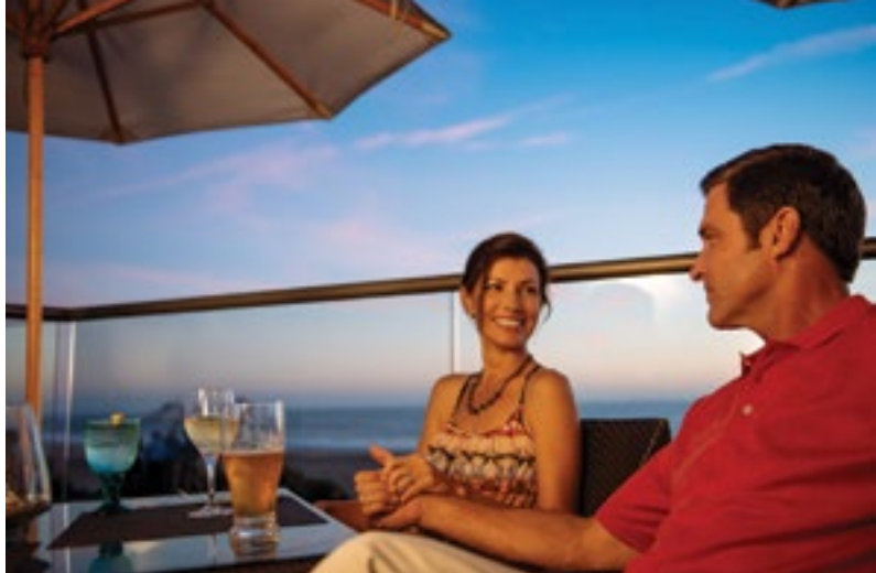
A beachside dinner is the perfect end to your vacation.

Rebecca Taylor, as well as gourmet dining options like Great Maple, which offers modern American options, and Red O, with a menu full of authentic Mexican staples conceived by chef Rick Bayless, a "Top Chef Masters" alum. For those looking for a more casual shopping experience, head to Balboa Island, also in Newport Beach, which is full of charming seaside boutiques and stands selling snacks such as the famed Balboa bars—chocolate-dipped ice cream bars smothered in sprinkles and perfect for sharing.