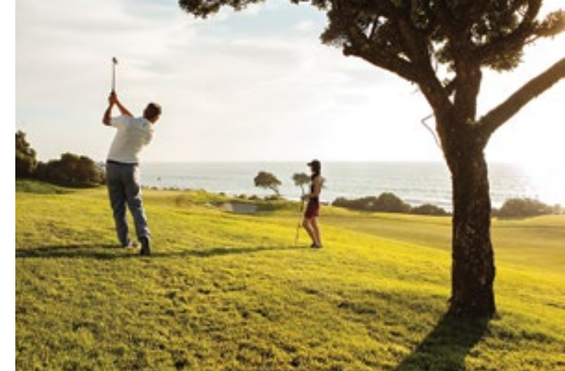
A round of couples' golf is a great way to bond.

The resort's spa also has a Coed Tranquility Lounge where the two of you can relax together before your scheduled treatments, as well as a Couples Personalized Massage, where you can enjoy a side-by-side massage in the privacy of the Spa Suite. And if there's anything you'd like to try that's not on the menu, according to Dallis, the staff is eager to help make your wish come true: "Our team is happy to assist in creating a personalized couples-only activity. We pride ourselves in creating a memorable, non-cookie cutter experience for ... guests." For some extra pampering, try out the on-property Drybar to receive a blowout or updo, all with a glass of complimentary Champagne. Active couples might also want to try