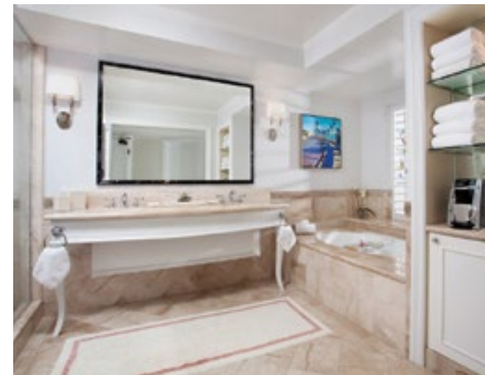
Interiors reflect a new coastal palette.

On your last day, sleep in and order breakfast via room service—fresh-squeezed orange juice, coffee and a variety of pastries will make sure your day begins on the right foot.