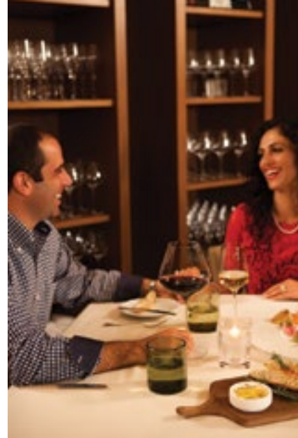
Book a reservation at Stonehill Tavern.

Once you're back at the resort, it's time to take in the best part of the day: sunset. There are plenty of alfresco dining options at Monarch Beach Resort where you can take advantage of the view, sharing a bottle of wine while you watch the sky turn orange and pink. Book a dinner reservation at AVEO Table + Bar, one of the property's signature eateries, for dishes with seasonal ingredients and a Californian influence, in addition to the beautiful outdoor space.